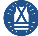
HIGH VISIBILITY CLOTHING